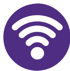
Internet or Wi-Fi Connection